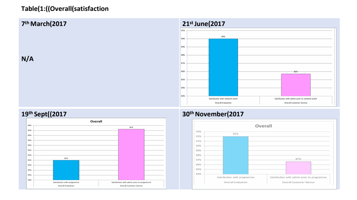
Table 1 is a summary of the overall satisfaction with the events (90-95%) and admin (86-96%). Table 2 outlines how well the network events met their respective objectives.

There many aspects of the networking events that attendees found helpful including: