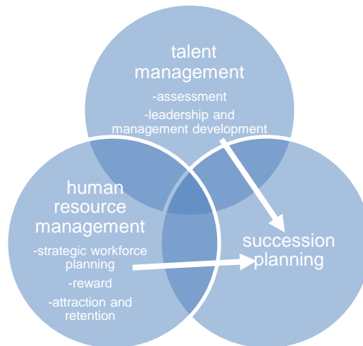
Figure 3 Linkages between HRM, talent management and succession planning