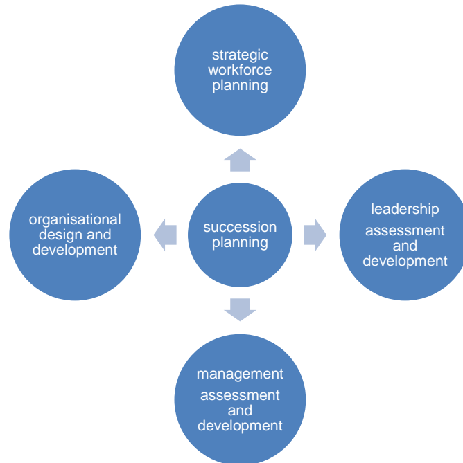
Figure 1 Activities included in the succession planning process

In its classical definition, succession planning normally deals with the highest two or three levels of the organisation.